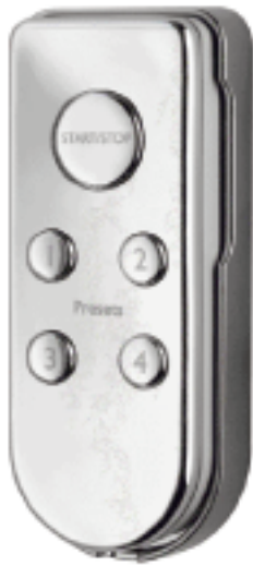
ilux Digital Shower remote control ILDSRC