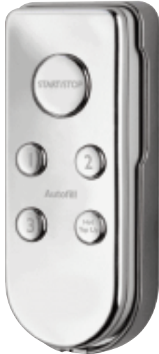
ilux Digital Bath remote control ILDBRC